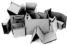
Cardboard (Yes, all those Prime boxes!)

Commingled recycling – these items can be placed in the cart.