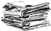
Paper (Office paper, brown paper bags, mail, etc.)