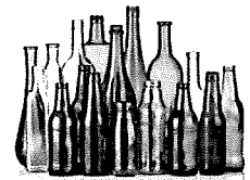
Glass Containers (After being quickly rinsed)