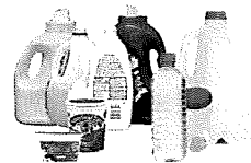
Plastic Bottles, Jars, Jugs and Containers (After being quickly rinsed)