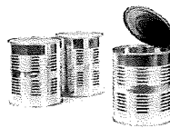
Aluminum Cans, Metal Containers (After being quickly rinsed)